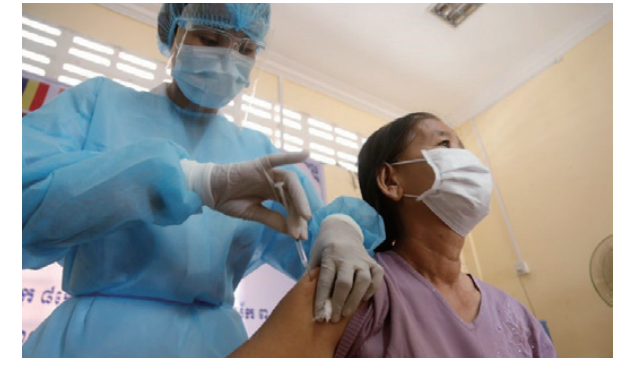
An old woman is inoculated with the AstraZeneca Covid-19 vaccine at the Pochentong referral hospital in Phnom Penh's Por Senchey district on March 23

The AstraZeneca vaccination campaign is being provided to the most vulnerable people in Phnom Penh and Kandal and Preah Sihanouk provinces only.